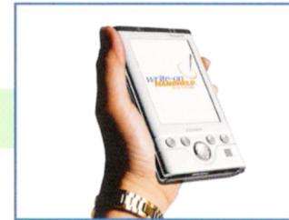
Wireless Handheld POS